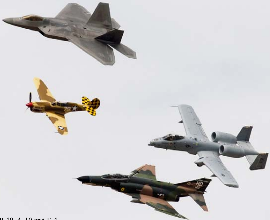
Heritage Flight from top, F-22, P-40, A-10 and F-4.